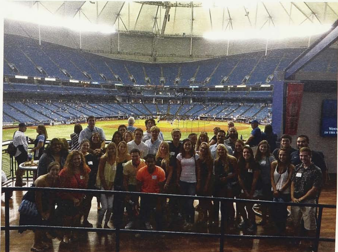
Members of D.S.P and guests attend a Rays Game.