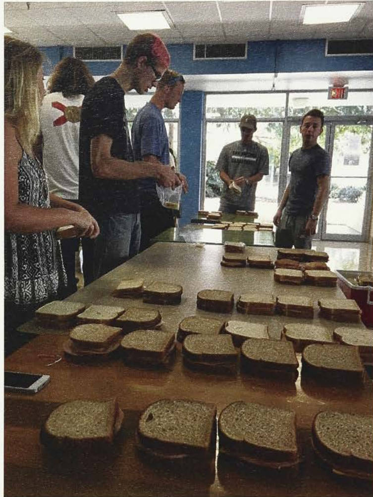
Colony members work with E.C.H.O to prepare and hand out sandwiches to the local homeless population.