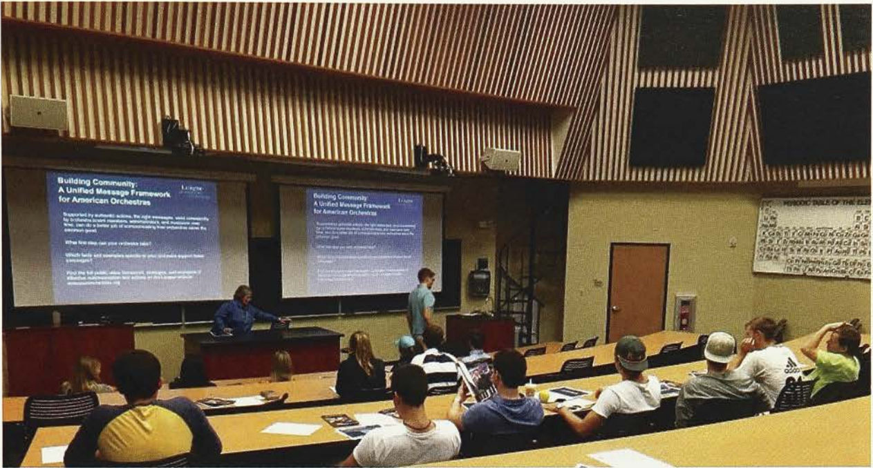
The Florida Orchestra talks to the Eckerd Colony about how their business works.