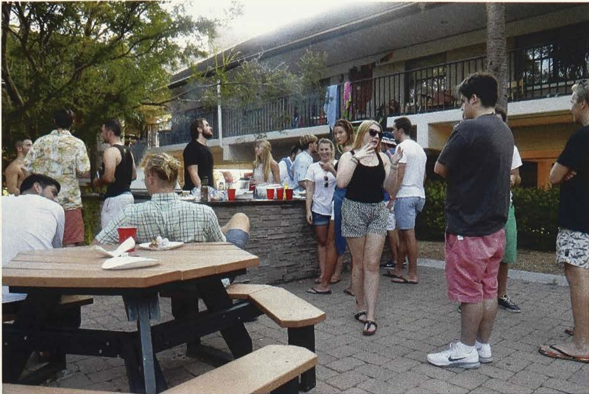
Members of Eckerd Colony gather for a picnic social.