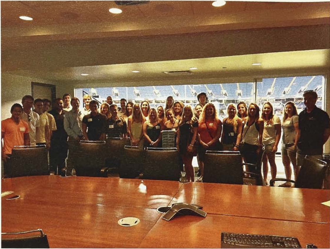
The Eckerd College Colony talks with the President of the Tampa Bay Rays about running a professional baseball team.